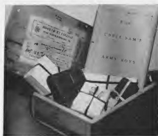
Merry Christmas, 1917